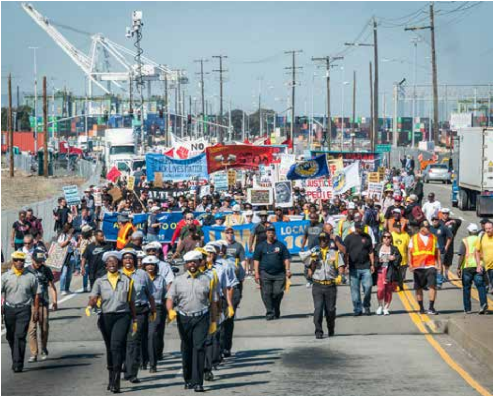
Labor Against Police Brutality March Oakland, CA.