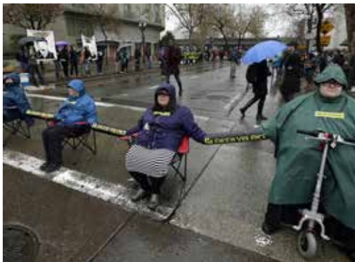
Shutting Down Oakland, CA Police Department.