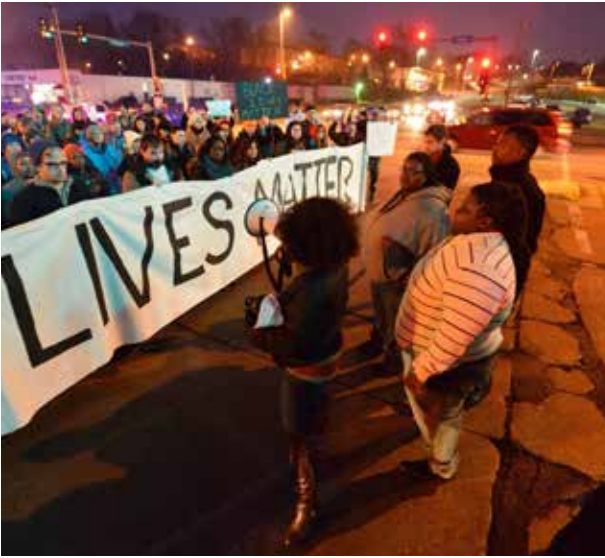
Young, Gifted and Black march in Madison, WI.

YGB is a mostly queer, female, and trans centered group dedicated to ending state violence against Black people through direct action. YGB has centered the myriad ways that state violence affects Black people, and has linked police killings with a fight to stop the building of a new jail in Dane county. State violence in Madison and Dane County is most visible through mass incarceration and vast racial disparities in the local aspects of the prison industrial complex, which are some of the worst in the country.