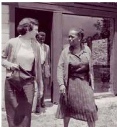
Ella Baker and Anne Braden leaving Civil Rights movement strategy meeting at the Highlander Center