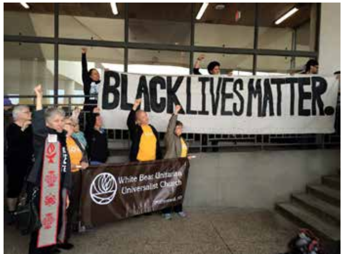
Rally in Minneapolis, MN.

What I’m learning from all of this in working with white people is that curiosity is a powerful motivator of connections, and that the stance we must take is an invitational one—not a strident, shaming, zealous one. When we have the latter posture, it’s too easy for white people to say, “Racial justice and anti-racism are somebody else’s issue, not mine.” But when we walk in the world in a way that allows people to enter into our personal stories, to ask us questions, to come closer, to see how they might also see racism and white supremacy as separating them from wholeness and health that they yearn for... People are willing to lean in and risk learning more.