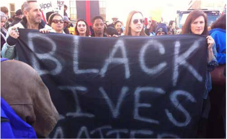
Reclaim MLK march St. Louis, MO.

us do all we can to aid and abet, and join with communities of color in liberation struggle, and do all we can to direct white resentment towards the powerful, while cultivating white solidarity with Black liberation and people of color-led struggles. For disruptive and militant nonviolent direct action in the spirit of the Civil Rights movement (which always focused on the systemic cause of uprisings, rather than the persecution of those initiating them). For multiracial movement building to unite people of all backgrounds for a society organized around the principle that Black lives matter. For an end to structural Black subjugation and premature death as acceptable conditions for capitalist profit and power.