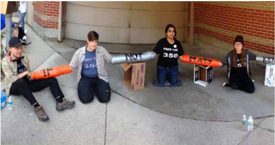
Allies for BLM blockade in Madison, WI.