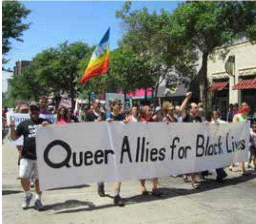
Wisconsin Pride.

up for and work for a world where Black lives matter, a world rooted in collective liberation—a world where we all get free, together.