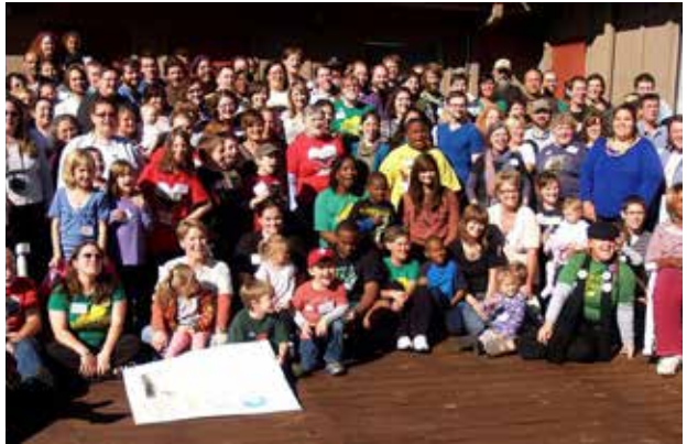
KFTC Annual Meeting.

But there are also costs that white people pay for participating in a system of white supremacy. Some of these are hard to quantify, such as the loss of true friendships across racial lines. But others can be counted in dollars and cents. By keeping Black and white people apart, the power structure effectively prevents them from coming together to win issues they have in common. Most Black and white people in Kentucky are working class, and could be uniting for fair wages, a fair tax code, and a healthy environment. Instead they blame each other, to the satisfaction of the capitalist forces that have a real stake in maintaining white supremacy.