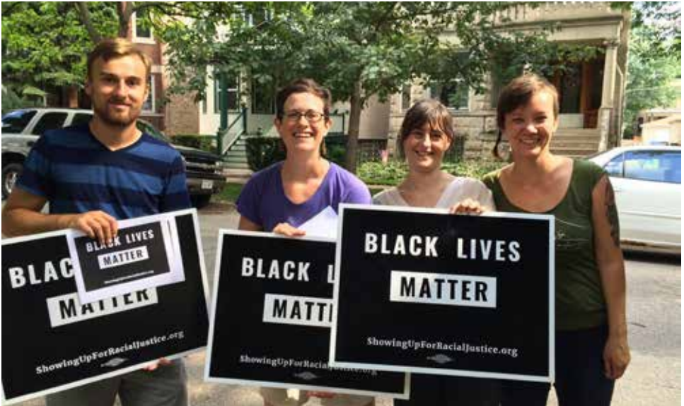
SURJ Door Knocking for BLM in Chicago, IL.

For me it's not about speaking for communities of color, but when it comes to racism, I'm speaking primarily for white communities. I speak out for white kids who I don't want to see grow up in this evil white supremacist system. I speak out for white people, many of us working class folk who have been screwed over generationally by the ruling classes who stoke the flames and encourage white hatred, fear, and resentment of communities of color. I speak out against ruling classes who mobilized white racism to keep both communities of color and white working class poor communities down. I speak out for white communities robbed of the humanity of people of color, while having our own humanity twisted and distorted in the service of mobilizing wealth and power to the 1%.