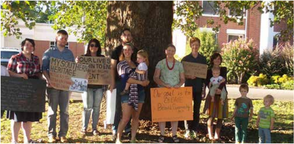
Working class communities rally in Dardanelle, AR.