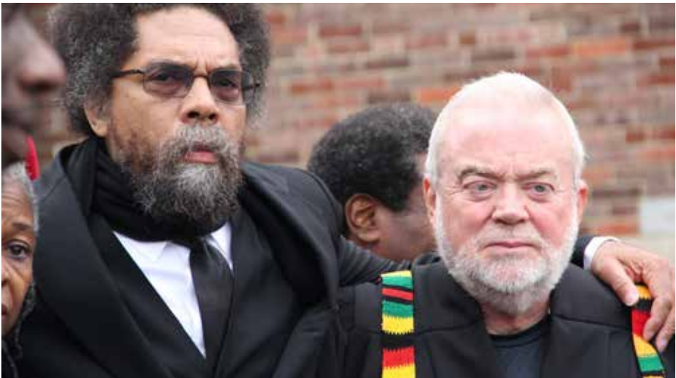
Dr. Cornel West and Rev. Jim Wallis march in Ferguson, MO.

1. We must nurture the hearts and souls of our faith communities to be able to look at the racist institutional and cultural violence that is burning all around us. To acknowledge the despair, the pain, the heartbreak, and to collectively grieve—to assume that everyone there, on some level, is grieving and to invite them into that space, rather than assume they are indifferent and uncaring, even if one could assume that