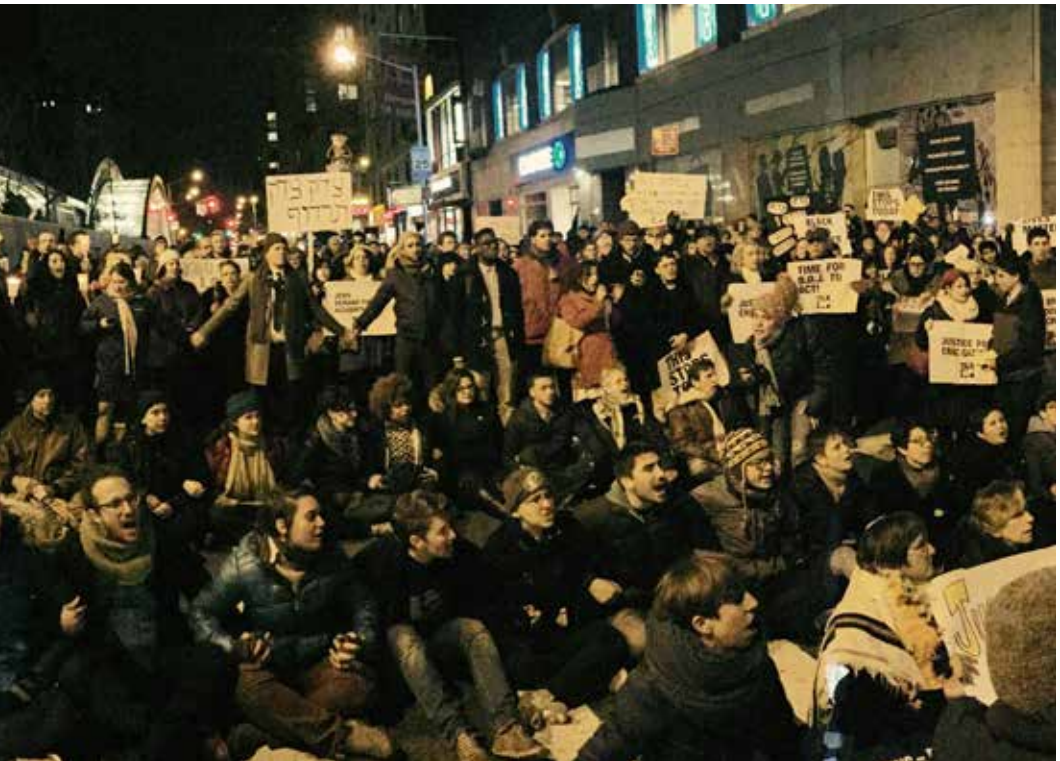
Jewish Leaders and Community Engage in Defiance for BLM.