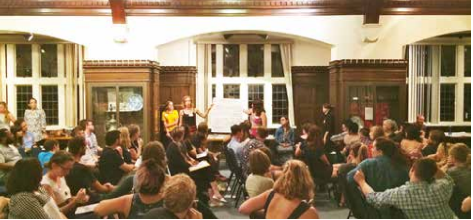
Nashville SURJ First Public General Meeting.

environmental organizations in Alaska contacted us for support. We were able to connect him to an environmental justice organizer in New York state to talk about what folks in other places are doing within the environmental movement to address racism. Creating avenues for local leaders to share what's working, to strategize together, and to draw inspiration from each other helps strengthen all of our work.