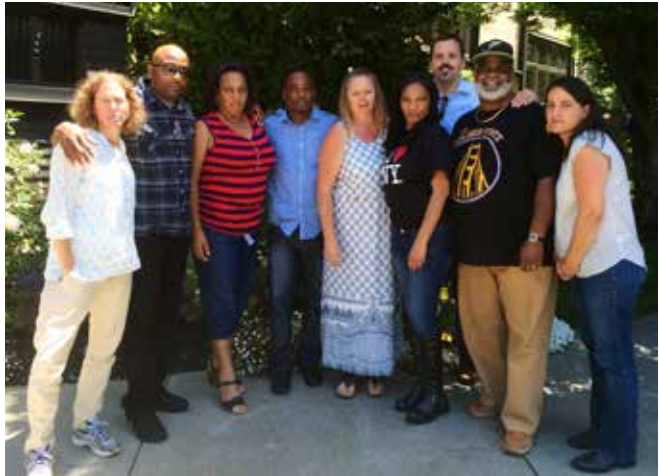
AFSCME Local 3299 Racial Justice Group.

to see how the fight for racial justice is part of our fight for economic justice. Ideally, this will make our economic justice campaigns inseparable from campaigns for racial justice at UC, and inspire Local 3299 leadership to actively participate in the BLM movement. A further measure of effectiveness would be our union's ability to collaborate with other unions and community-based worker organizations across California to further expand labor movement support for the BLM movement.