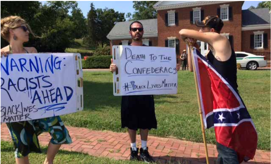
Protesting a Pro-Confederate Flag Rally in Richmond, Virginia.

Every white person who refers to Charleston as “incomprehensible racial tension” (which narrates it as equal people who equally don’t like each other, and it’s impossible to understand) is providing cover to murderous, historically rooted, structural, and cultural white supremacy that is growing stronger every day.