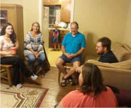
Community Discussion on Racism and Racial Justice at the McElroy House Dardanelle, AR.

You asked about talking points to open these discussions. My suggestion, to help you prepare for the community discussions, is to first have a group conversation amongst yourselves as the leadership/planning team, on what helped open your eyes to these issues—what questions, what conversations really moved you. And then ask: What questions can we ask that will help open this space for conversation, learning, and vulnerability with other white people? And, in these events with