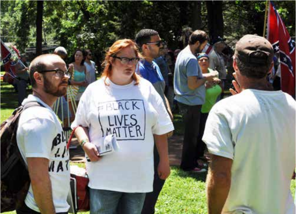
Counter-protest at Confederate Rally in Hillsborough, NC.

That said, my advice is to prioritize building active support with staff who are most receptive, and then other staff who seem open, as well as members and supporters in the broader community who you have affinity with, trying to get as many folks who have organization influence on board as you can, while also having these conversations with your director. To the best of your ability, try to stay in the position of being a leader building up your community's capacity to be awesome for racial justice and try to diminish the possibility of this just becoming an antagonistic relationship between you and your director that gets locked into a dynamic in which neither of you can be your best selves and you can't do the work you want to do.