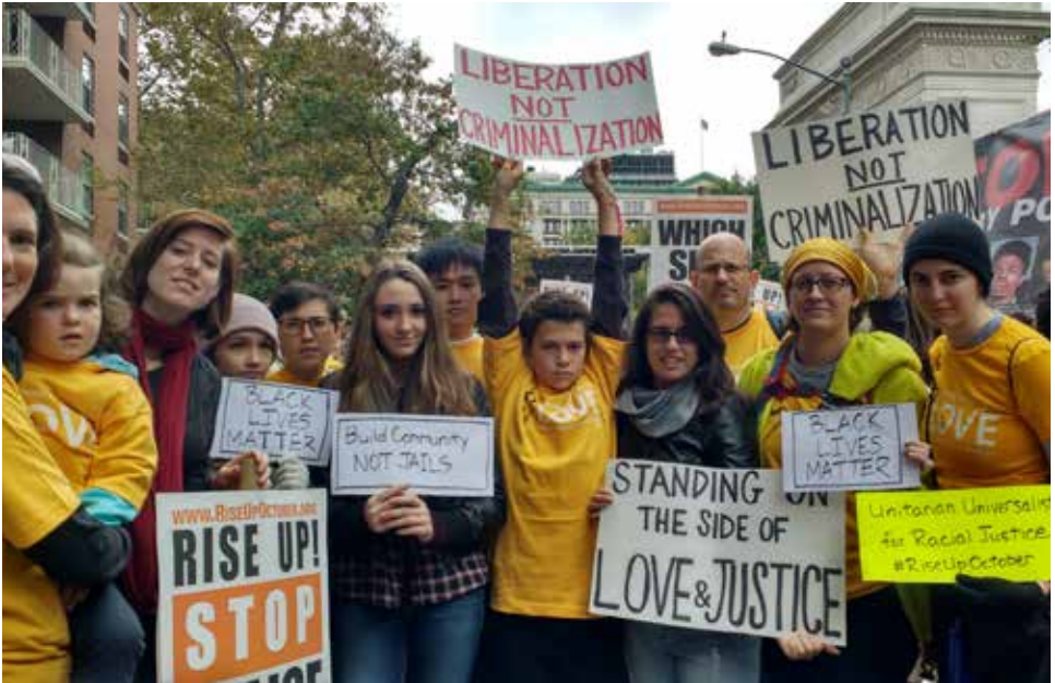
Unitarian Universalists March Against Police Brutality in New York City, NY.

To become an anti-racist faith community, the key question, for a white/white majority community, is not, "How do we get people of color to join our faith community?" it is, "How can we make a prolonged, spiritually-rooted, engaged commitment to uprooting white supremacy within our community and take on-going collective action to challenge it in society?"