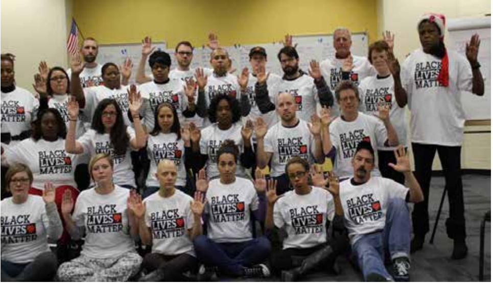
Public School Teachers Organizing in North Carolina.