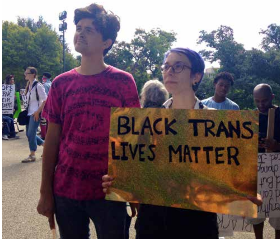
Rally Against Police Brutality at the Texas State Capital.

All Lives Matter is the new “special rights” smear tactic utilized by the White Citizens’ Councils and Klan against the Civil Rights movement. Which side are you on? To those who argue “all lives matter,” remember, just as we look back on those who declared “Segregation Today, Segregation Tomorrow, Segregation Forever,” history will see you.