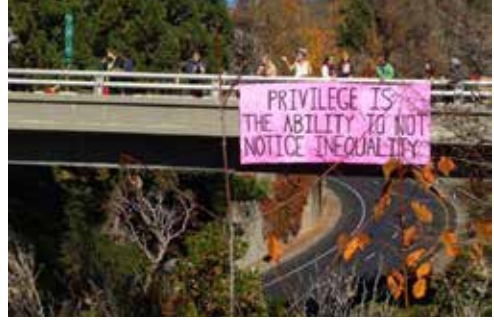
Banner Hang in St. Louis, MO.

Similarly, we have white members in six different towns now organizing right wing radio call-ins (White Silence in the South Still Equals Death: Right Wing Radio Call-In Toolkit available at http://southernersonnewground.org/radiotoolkit/ ) as a political intervention after the Emanuel AME Massacre in Charleston. After the massacre, we saw the media erroneously spin the attack as a gun control debate and the assailant as a “lone wolf.” So we are challenging ourselves and other white people to engage these pundits in a conversation, not to persuade them to join the Homosexual Revolution, but to challenge their hegemony and the power they have over the airways. This work is about building our collective muscle to fight and share a different story, vision, and understanding, especially with the other white people who may be listening to these shows. I also share this because it’s an example of what we mean by experimentation—Will we get on the radio? How will the pundits react when we do? This intervention allows us to step into the rink and to try to figure out how to directly access some of our cultural war opponents, who are creating and reinforcing so much hatred and consequent violence. Some of our members in Atlanta got on the radio the other day and were so pumped after listening to right wing radio for five days and stressing all the way out.