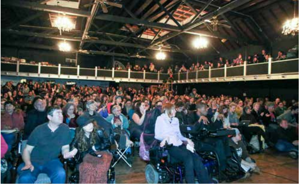
Over 1000 people show up for panel organized by Catalyst Project.

bring other white people with us (not the ones firmly committed to upholding white supremacy, but the people around us who are often quiet in these conversations, on the sidelines, perhaps trying to make sense of what’s going on, but don’t know where to start—i.e., the people we need to be talking with, building with, and organizing, rather than wasting precious time and energy on Internet trolls).