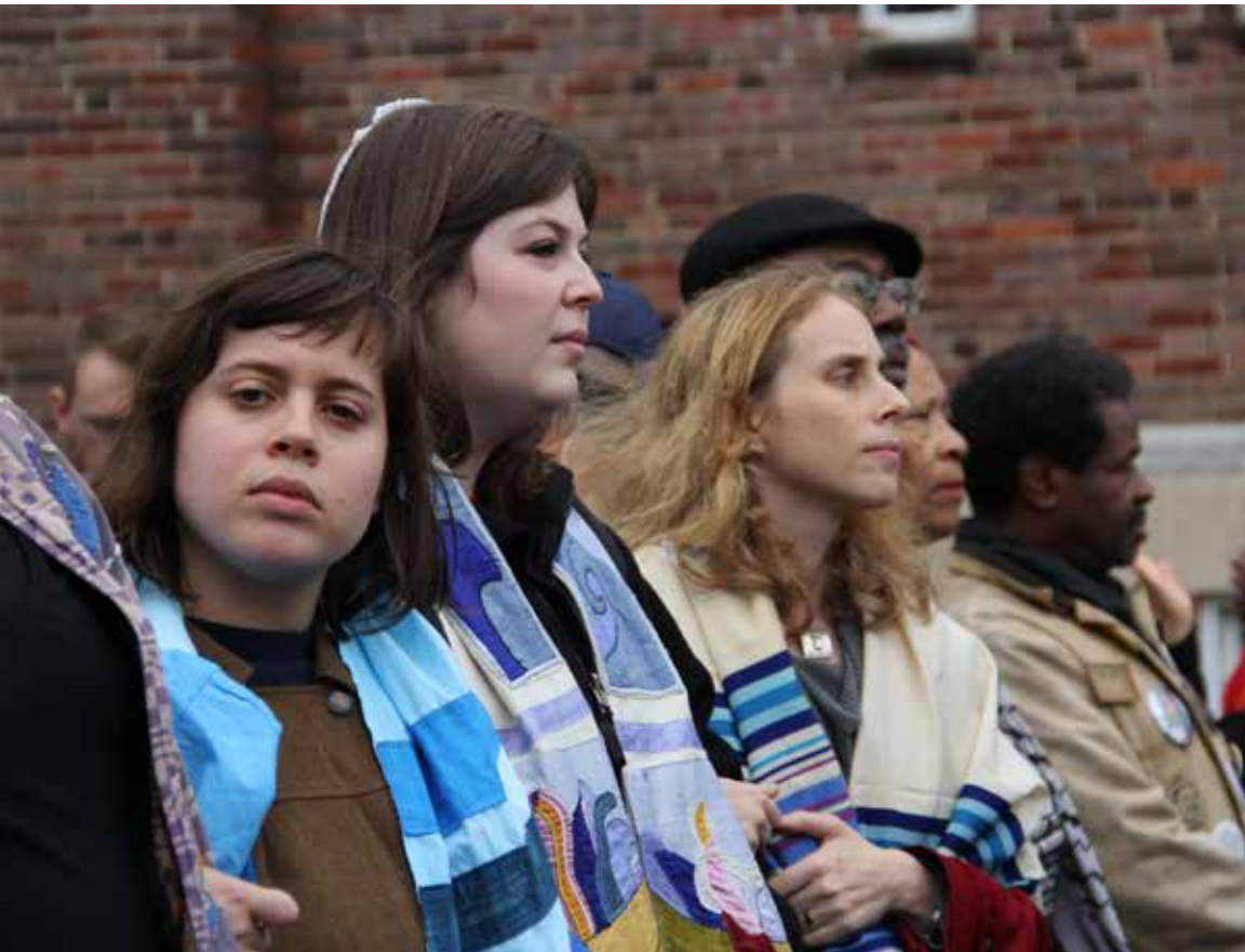
Rabbis and Jewish activists march in Ferguson, MO.

For those of us who are white in the wake of the Charleston Massacre, an atrocity that sparked national outcry in the long history of the racist violence of the United States, it is not the time for us to call for racial tolerance, racial healing, racial dialogue, or racial understanding alone. When white people say these things, even with the best of intentions, the underlying message undermines Black rage. It erases Black pain and Black resistance and serves white people's guilt and grief with vague gestures that do more to confuse rather than clarify both the problem and the solution.