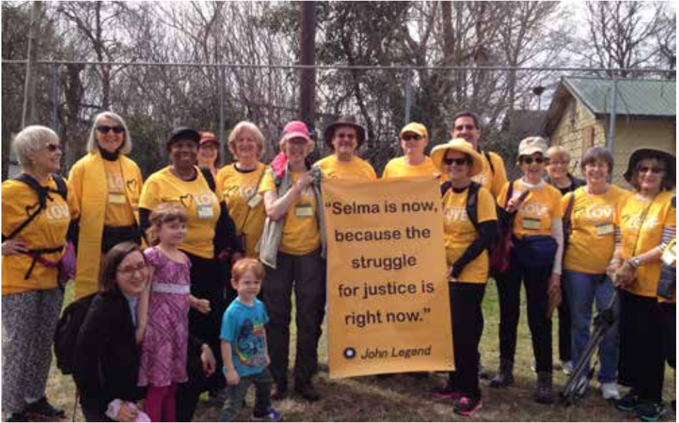
River Road UU Church of Maryland in Selma, AL for 50th Anniversary.

and bringing their spiritual and religious leadership into the streets for marches and civil disobedience.