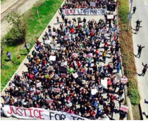
Young, Gifted and Black marches in Madison, WI.

years. Either they have taken a workshop or have been more closely involved in the organization. Similarly, the base building and educational work of groups of color like Freedom Inc. have helped bring a base of leadership and analysis to the current movement moment. Multiple new organizations have grown, contributed, and strengthened over this time period as well.