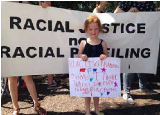
Rally for BLM at State Capitol in Austin, TX.

know three inspiring, life-affirming stories of resistance for each story of devastating racist violence. One of the key challenges before us isn't just awakening white racialized people to the reality of racism, but to help ourselves and others truly believe we can bring it down and build up robust, complex, living and breathing Beloved Community. We are carrying on the legacies of our movement ancestors and the impact of our efforts is beyond what we often dare allow ourselves to dream.