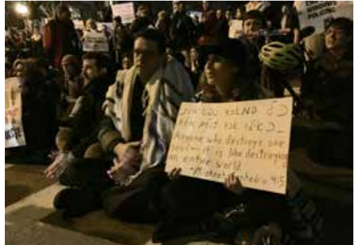
Jewish Leaders Take Direct Action for BLM in New York City, NY.

“Our goal is to build and be part of beloved community united to end structural oppression...”