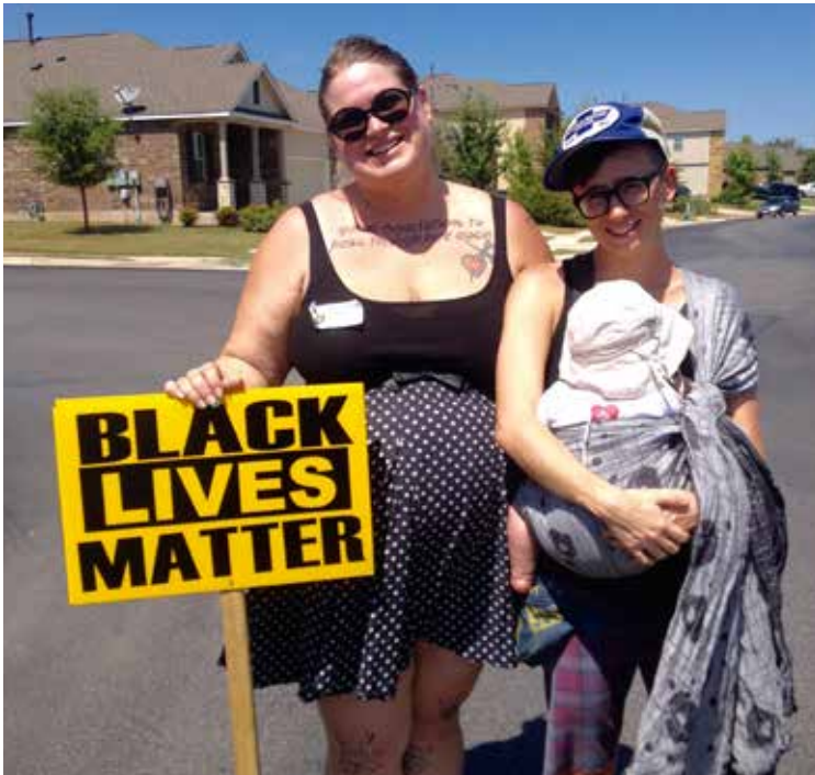
Door Knocking for BLM and Giving Out Lawnsigns, Austin, TX.