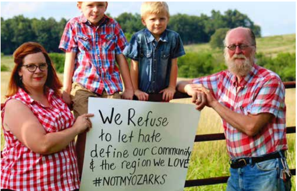
Not My Ozarks anti-racist, anti-Klan campaign.

The more I worked in white communities against racism and for racial justice with a collective liberation vision, the more it became spiritual work. It was spiritual as I began to see and experience the devastation of white supremacy on white communities. I had seen it in my own family, in my Grandfather and in my uncles: the resentment and anger towards Black and Brown communities, anger and resentment that was toxic and ate away at their and other white people's humanity, their sense of justice, safety, and democracy in the world. Now, as a father with two young white boys, I understand anti-racist work as fighting against the monstrosity of white supremacy that steals the lives of Black and Brown children and devours the humanity of white children.