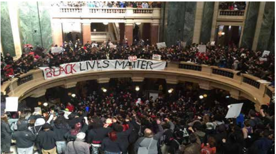
Occupation of Capitol, Madison, WI.

As people racialized as white in a white supremacist society, we must forge new identities rooted in liberation values, and committed to challenging structural oppression. This is the process of unlearning the lies of capitalist individualism and racist fear. This is the process of embracing our shared humanity, creating a just world and building beloved community. When we break white silence that gives consent to racism, we must speak fluently and courageously about a life-affirming culture and society that also uproots capitalism and builds economic justice for all.