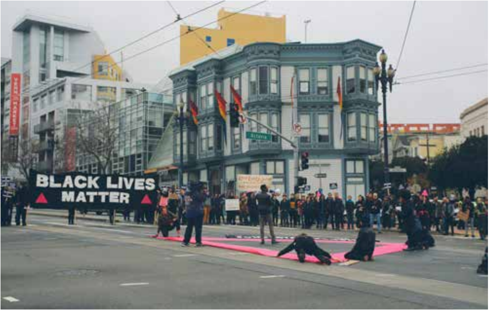
Queers for BLM Direct Action in San Francisco, CA.