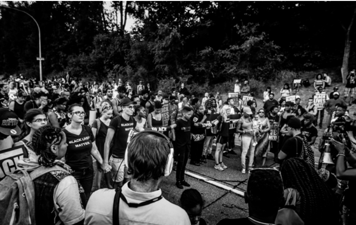
BLM direct action in Toronto, Canada.

But first, why is this a book written by a white person, for white people, when this is about the Black Lives Matter movement? I was radicalized by the Rodney