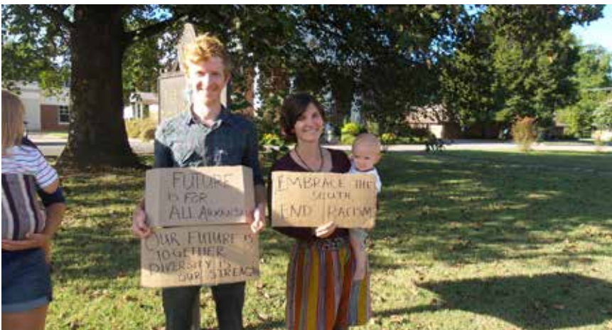
Dardanelle, AR.

But often times people come to me and want to know how they can convince someone in their family who they love, but who they doggedly oppose politically. My response is this is that we need to spend less time trying to move people who aren't moveable and focus our energies on people around us who, in moments like the uprising in Ferguson, are actually moveable. People around us who are asking questions, who