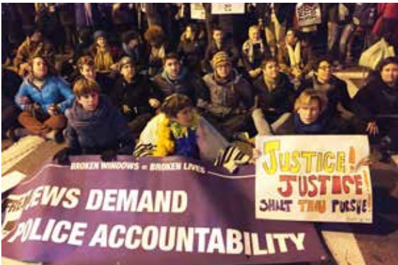
JFREJ Mass Direct Action for Eric Garner, New York City, NY.

Tears ran down my face as I followed the news, often with my three-year-old son nearby, of powerful, defiant, Black-life-affirming, white-supremacist-hegemony-defying marches, vigils, and large-scale direct actions igniting around the country after the Eric Garner non-indictment; and NYC was galvanizing us all. And JFREJ was a powerful force mobilizing a mainly, but not entirely, white Jewish base of members and supporters to be courageous for Black Lives Matter. I've long loved JFREJ, which began in 1990, and has been deeply committed to long-term multiracial organizing and campaigns to build people's power for collective liberation. As their mission statement reads, they are "inspired by Jewish tradition to fight for a sustainable world with an equitable distribution of economic and cultural resources and political power."