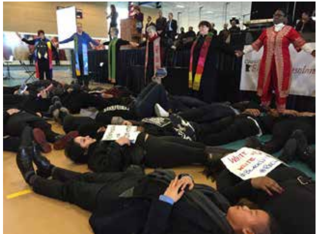
Die-in at Mall of the America, Twin Cities, MN.