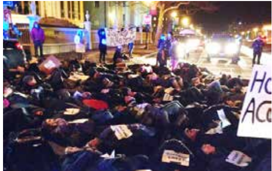
Die-In for Eric Garner Portland, ME by the Racial Justice Congress.