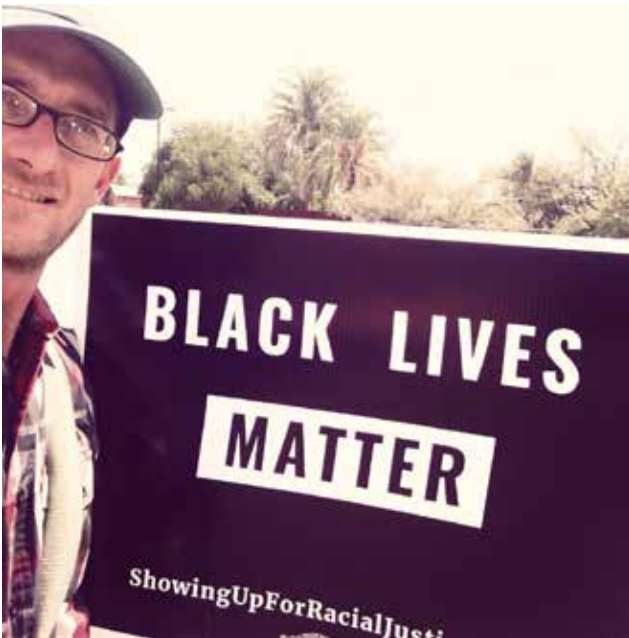
SURJ Doorknocking, Tucson, AZ.

Racist policing isn't based in irrational fear, bigotry, and hate of Black people. Those are the symptoms of a much deeper fear and hatred held by ruling class power, historically and today, of Black resistance to supremacy systems, the Black radical democratic tradition, and fierce, persistent, Black leadership. For those of us who are white, it is essential to understand that we aren't just standing against Black racist victimization by the police, but we are standing with Black leadership for a new world.