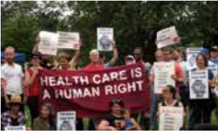
SMWC Health Care as a Human Right Campaign.