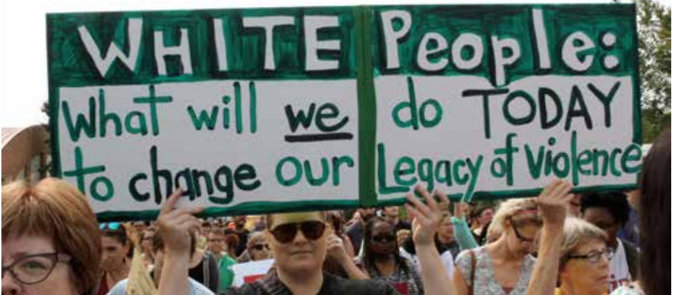
BLM rally at MN State Fair.

Every white person focused on explaining how much they personally like Black people and so therefore racism can't exist needs to take a long hard look at how the shooter clearly had a plan, was methodical, and patiently implemented horrific acts, while ensuring survivors could spread the news of this terrorist attack, to further terrorize the Black community.