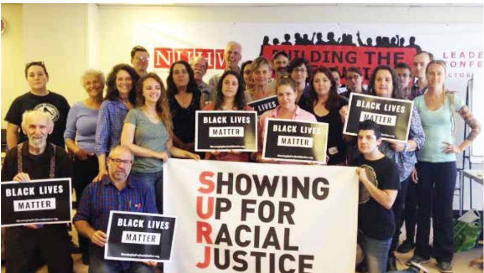
SURJ Members Preparing For BLM Door Knocking San Francisco, CA.