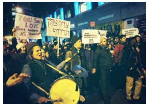
JFREJ Action for Eric Garner.

JFREJ has also been working with our partners to fight against police brutality for nearly two decades, so the recent upsurge in movement work across the city and country is deeply inspiring. In today’s fight, we’re using multiple tactics that confront the violence of whiteness through the strategic use of public space and media, and the resilient insistence upon cultivating allyship. One effective tactic we recently under-