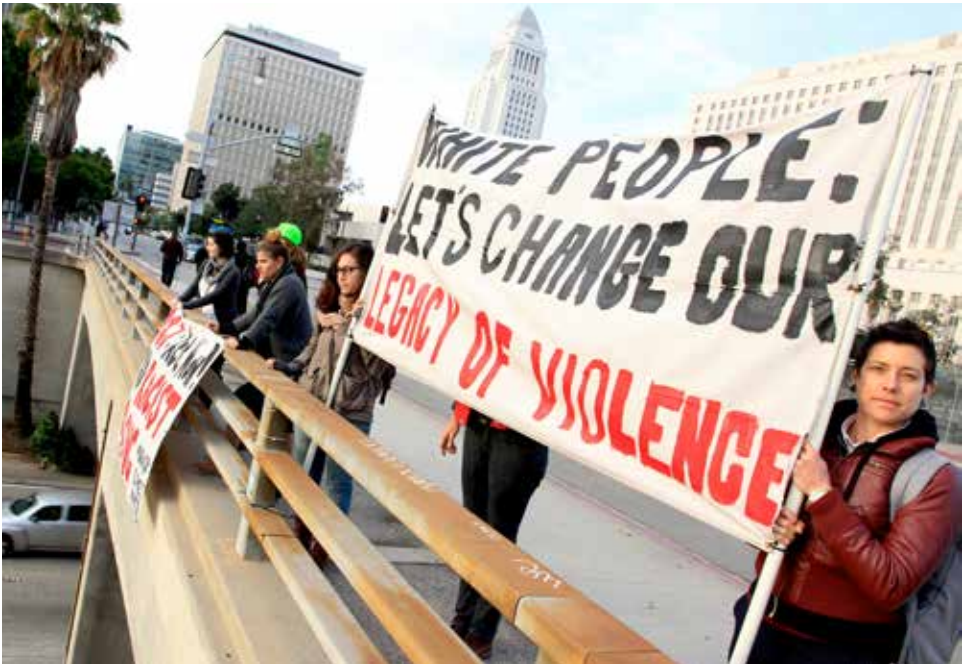
Banner hang in Los Angeles, CA.

For those of us who are white and have been engaged in anti-racist efforts, we need to support other white people to tap into their grief, pain, and sadness about Charleston and turn it into a commitment to the destruction and abolition of institutional racism. No calls for healing disconnected from militant resistance from white people against this brutal racist society. No messages meant to soothe white people's souls, and ease them/us back to sleep. We need messages and leadership to help build the capacity of white people to stay in discomfort, to stay in the dis-ease to truly hear and listen to the voices and experiences of Black people, with the goal of putting raised consciousness into action against racism.