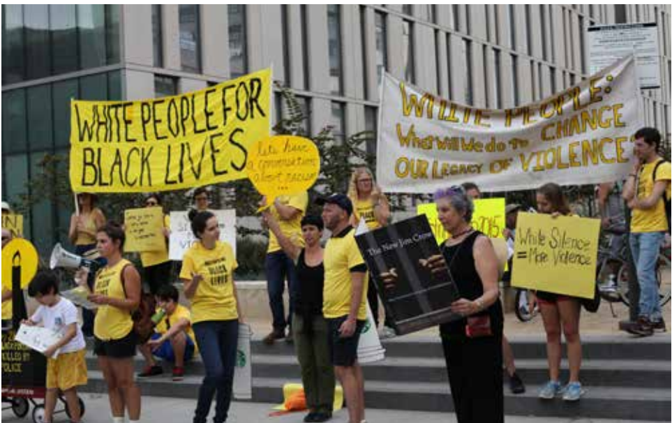
Rally and Street Theater at SURJ Los Angeles White People For Racial Justice March.