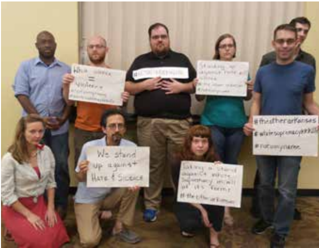
Little Rock, AR Collective Liberation Study Group.

reaction was fear. Fear that these teenage boys would re-enact countless scenes of racialized crime and violence that I've consumed since I was a little kid. It's not the kind of experience someone who has been doing anti-racist work for twenty-five years likes to admit having, but this isn't a time for false pretenses to protect our egos. This is a time for white people to recognize that our irrational fears of Blackness are the result of the logic of