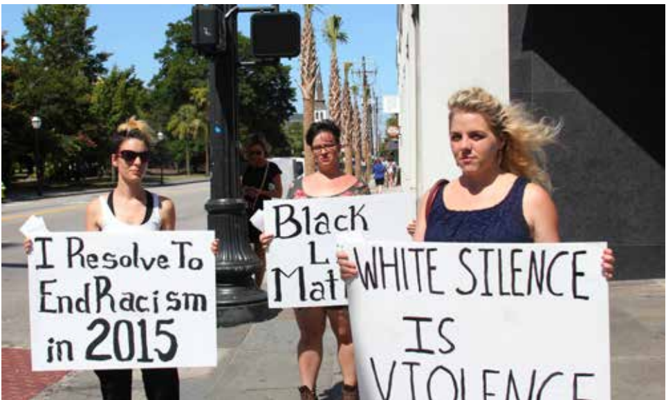
SONG members protest for BLM in Charleston, SC.

The national outrage of Black churches burning and the Charleston massacre—where a young white supremacist assassinated women, men, and young people gathered for a prayer meeting—and the national outcry against the Confederate flag growing has brought attention on the South. While many in the North and the West look