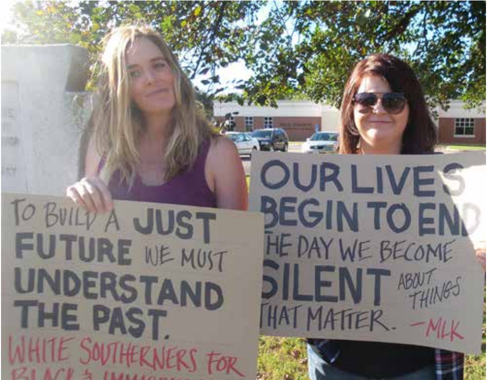
Dardanelle, AR population 4600.

When you leave out challenging the structures of power, then our work against racism and white privilege can very quickly become focused on individual behavior. Without a power analysis, then it can become just about raising awareness, without the larger goal of making structural change. Structural change requires building move-