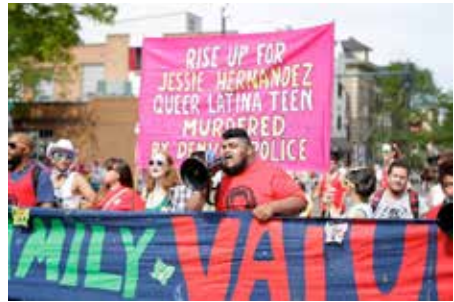
Denver, CO Pride Anti-Police Brutality Contingent.