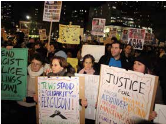
Jewish Voice for Peace March for BLM in Boston, MA.

My goal isn't to be a great ally. My goal is the abolition of white supremacist capitalist patriarchy and the building up of multiracial democracy, economic, gender and racial justice for all and a world where the inherent worth and dignity of all people and the interconnection of life are at the heart of our cultures, institutions, and policies.