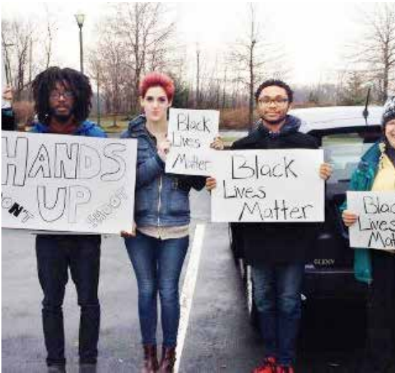
KFTC members rally in Berea, KY.

Chris: What challenges are you facing? How are you trying to overcome them? What are you learning from these experiences?