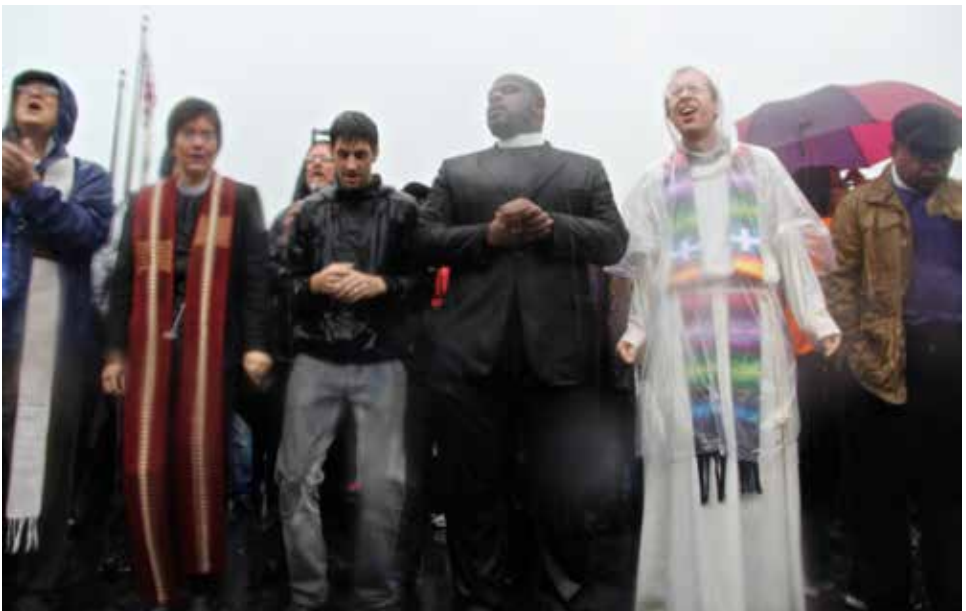
Clergy March in Ferguson, MO.

Love to my beautiful Unitarian Universalist family in Fort Worth who put out a powerful statement on why they stand in solidarity for Black Lives Matter and have committed to replacing their banner, no matter how many times it is vandalized. Love to the hundreds of Unitarian Universalist churches who have also placed banners in highly visible places in front of their churches. As white people of faith, we don't just act in solidarity; we also act to save all of our souls from the monstrosity of white supremacy.