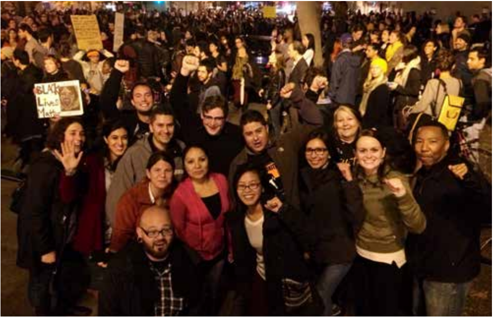
AFSCME Staff at BLM March Oakland, CA.

AFSCME Local 685—was not convinced that there would be adequate funding to address the workload increase that would result from sentencing reform.