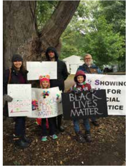
SURJ Families Protest in Louisville, KY.

Third, to help build and nurture my family with liberation values/culture as part of a larger beloved community that loves kids and honors the magic of childhood.