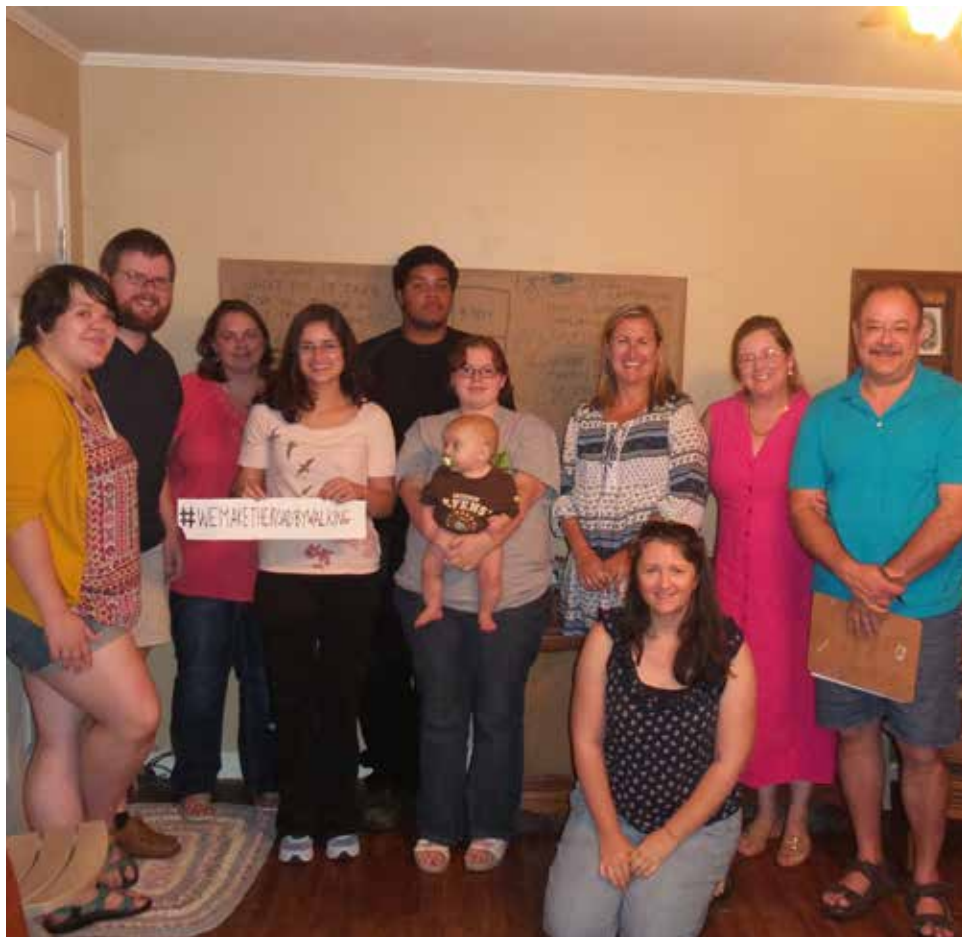
McElroy House Livingroom Conversation on Anti-Racism in Dardanelle, AR.