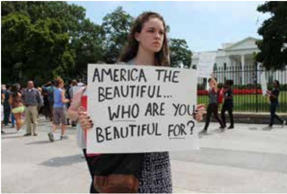
Mike Brown Silent Protest at the White House, Washington D.C.

For all of us who want to move white people into anti-racist consciousness and actions, we must remember the dual role that anti-Black racism plays in disciplining white people to capitalist exploitation. Anti-Black racism was most famously fused into popular culture and ideology through the Blackface minstrel shows. The minstrel show became the national art form by the mid-1800s, and