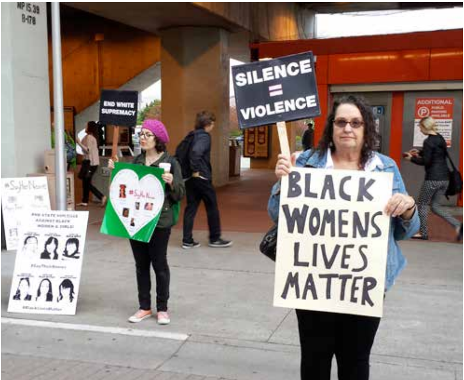
SURJ visibility demonstration during morning commute, Walnut Creek, CA.

3. I need to be more educated/trained to take action: Yes, we need education and yes we need training. AND, we learn so much in the process of taking action,