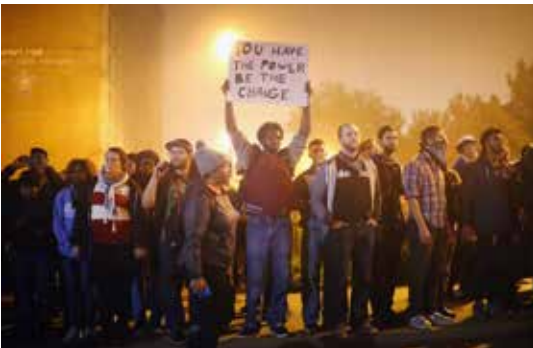
Occupy St. Louis University, MO action.

“For multiracial movement-building to unite people of all backgrounds for a society organized around the principle that Black lives matter.”