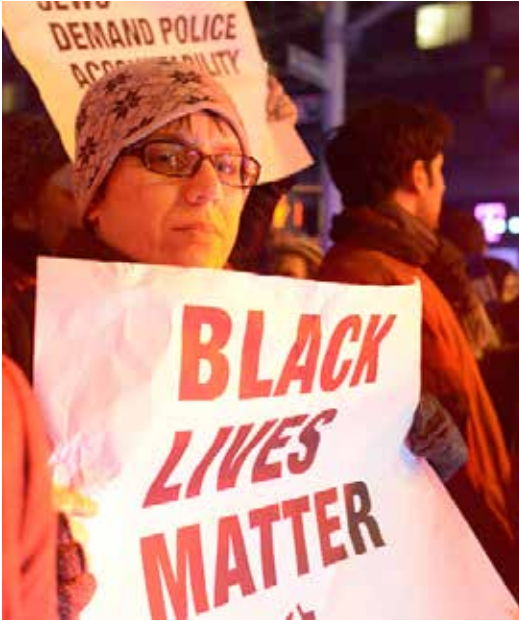
JFREJ Action for Eric Garner.

haphazardly being fit into support roles. We are steadily developing clearer thinking and principles to guide this transformation, and experiencing progress, but we recognize how much we still have to learn and build.