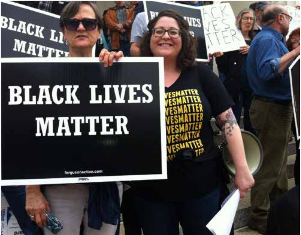
Rally Against the Aryan Brotherhood, St. Louis, MO.

“Beloved community isn't born of white hand-wringing but white hands going to work for revolutionary racial justice change.”